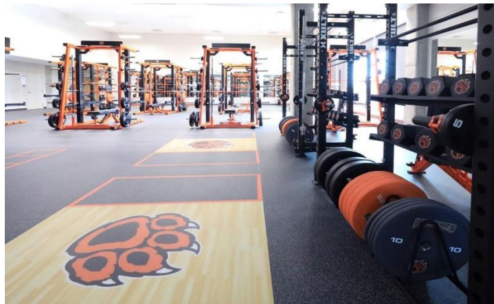
Verona HS - Fitness Center