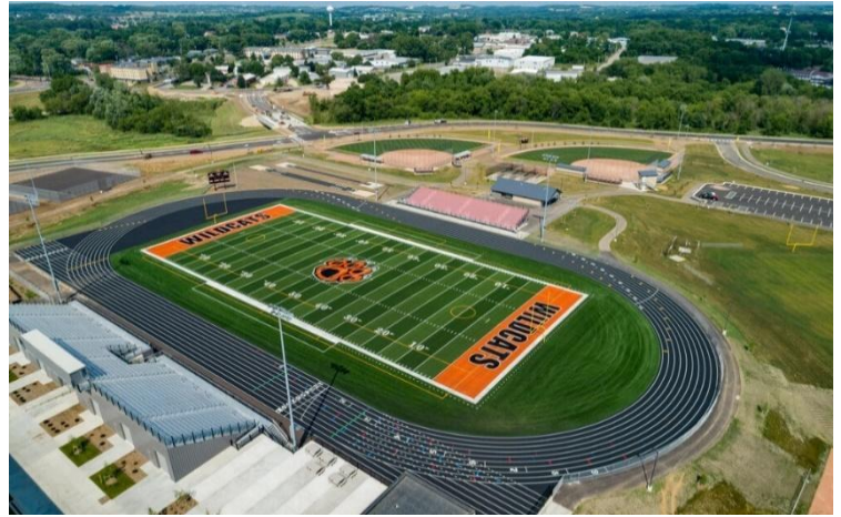
Verona HS - Track & Field