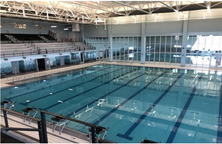
Verona HS - Aquatics Center

SEE MAP ON NEXT PAGE FOR MAP OF SCHOOL & PARKING LOTS